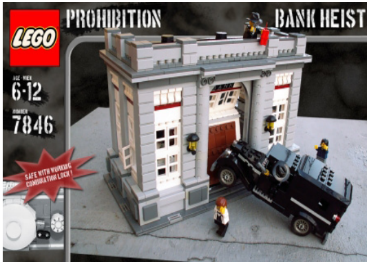
The only problem with this, is that most kids of the 99% won't be able to afford it! (or put it together for that matter)

All this adds up to one logical option, which is that all those kids sleeping on the ground down in NYC need to band together and start taking the money the only way open to them. There are tens of thousands of banks across America just waiting to be pilfered, and even more ATMs ripe for being ripped out of walls. It's only a matter of time before America goes back into that sort of mess.